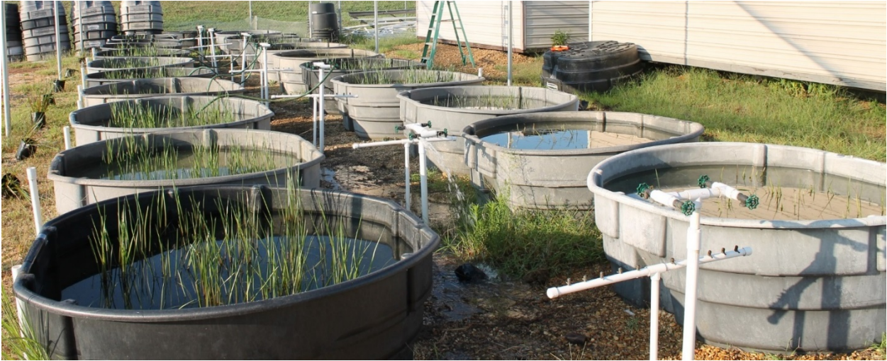
Photo 2. Ongoing mesocosm trial at the MSU APRF.