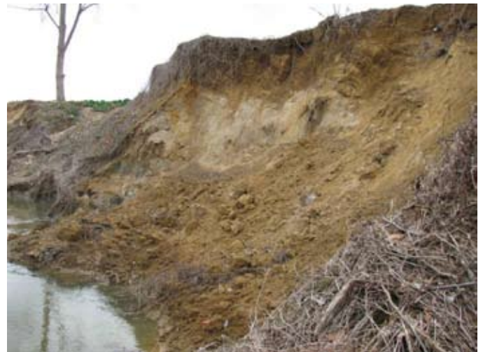
Figure 3. Incised unstable channel at the Yonaba Creek, MS