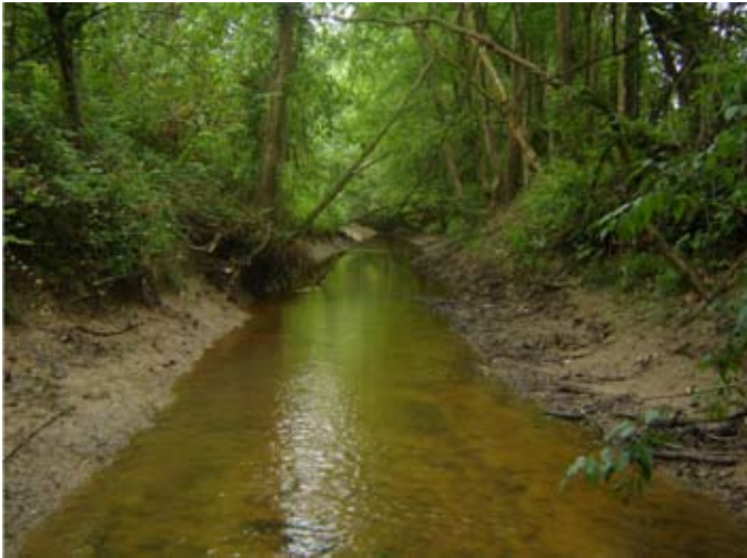
Figure 1. View of a creek at the headwaters of Town Creek, MS