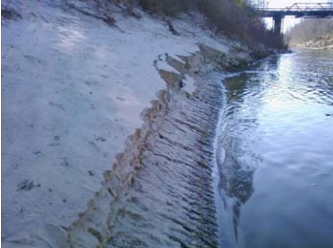
Figure 6. Sand deposition on streambanks at the middle section of the Town Creek, MS