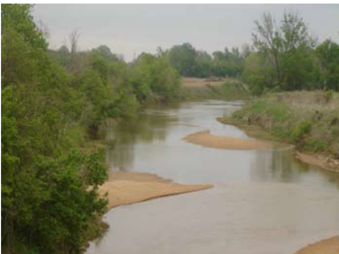
Figure 8. Meandering low flow velocities and bed sediment deposition at the least 10 km of Town Creek, MS