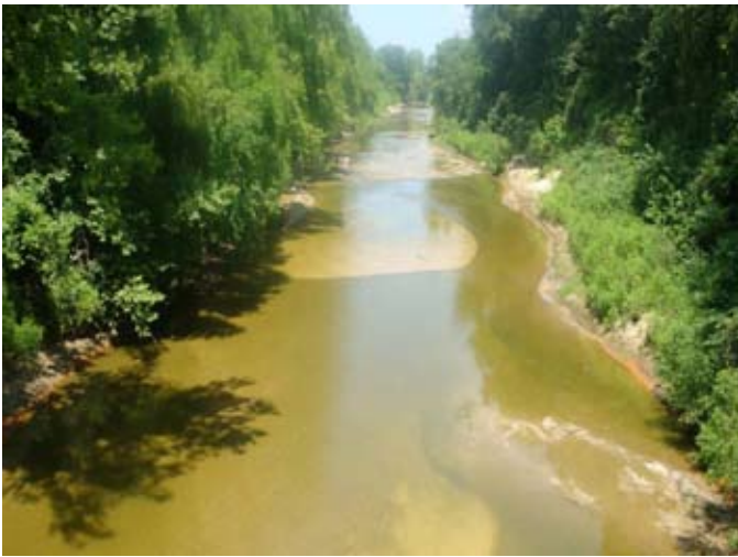
Figure 7. Mobile ber at the middle section of the Town Creek, MS