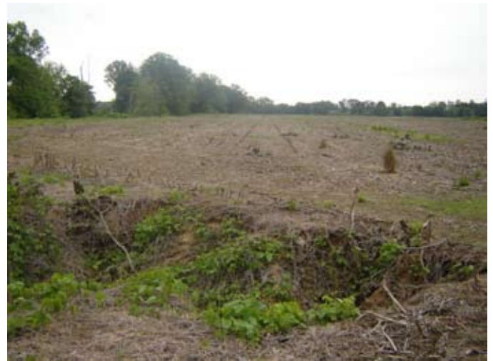
Figure 4. Gully erosion formation in an agricultural field with reduced presence of riparian zones at the Town Creek headwaters.