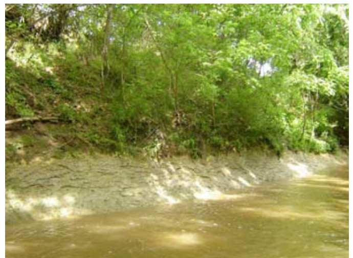
Figure 5. Fluvial erosion at the Town Creek headwaters in MS.