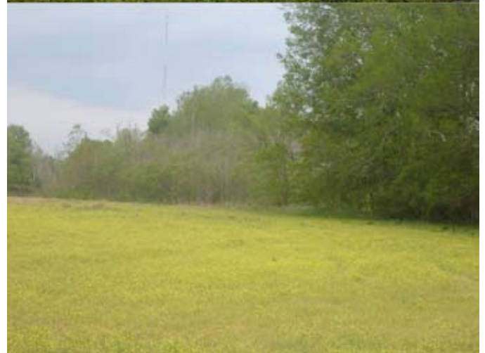
Figure 10. View of agricultural fields with an established riparian zone