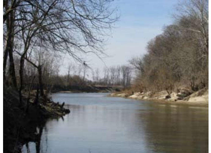
Figure 9. Meandering low flow velocities and streambank sediment deposition at the least 10 km of Town Creek, MS